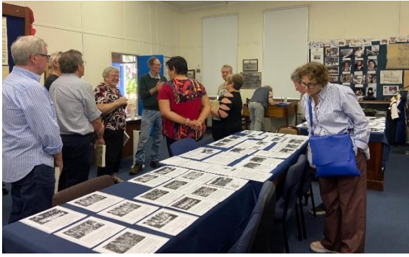
Class of 1972 Reunion – 28 October 2023