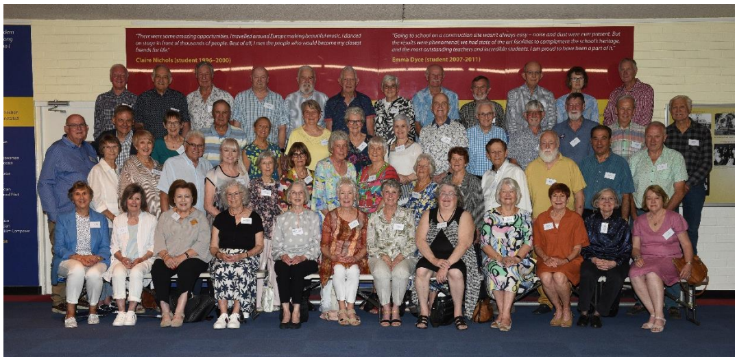
Class of 1963 – 60 year reunion

This year has seen a return to “normality” where school reunions and year reunions have been able to take place without restriction and with limited effect due to illness, while the work in the museum has been uninterrupted. In the last half of the 2023 year in particular, there were year reunions taking place (1963 and 1972 at PMS), although the Perth Modernian Society Annual Reunion (September 2023) was cancelled with too few attendees. For those who did respond, the school Music Department generously invited alumni to attend the final senior concert – a wonderful evening of celebration!